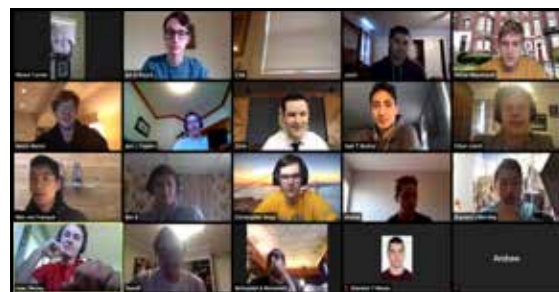
Virtual Chapter Meeting on Zoom.

The advent of the Corona virus Pandemic and the subsequent shutdown and removal of students from campus a week after the announcement was a monumental event that knocked every brother's world upside down. Student leaders were able to convince the administration to change the grading to Pass/No Record as well as implement different changes to make MIT be less stressful now that it was fully remote. MIT recently announced that only Seniors and students with significant exceptions would be invited back to campus in the Fall, translating to campus running at 40% capacity. Additionally it was decided that fraternity, sorority, and independent living group houses would remain closed for the fall. IFC has worked with the MIT administration on the solutions it has come up with thus far, and will continue to push for the fraternity community like potentially letting Seniors live in their FSILGs in the Spring. The biggest problem that the IFC is debating right