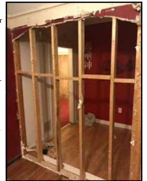
Converting Myles from a double to a triple by removing the wall separating it from the 4th hall closet.

to accommodate new arrivals in the house. A great idea for our upcoming virtual semester, to continue the tradition of dinners, would be alumni meet-and-greets local to certain cities where there might be a lot of undergraduates, e.g. SF, Boston, NYC, or virtual/zoom link-ups for meals. In addition to this, a big part of my responsibilities this semester was applying for awards, which paid off well! We won 3 awards from national this year which was awesome; looking forward to our chapter receiving more much-deserved recognition.